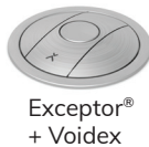
Exceptor® + Voidex